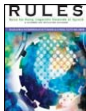
RULES: Rules for Using the Linguistic Elements of Speech